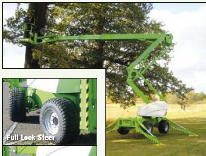
Full Lock Steer